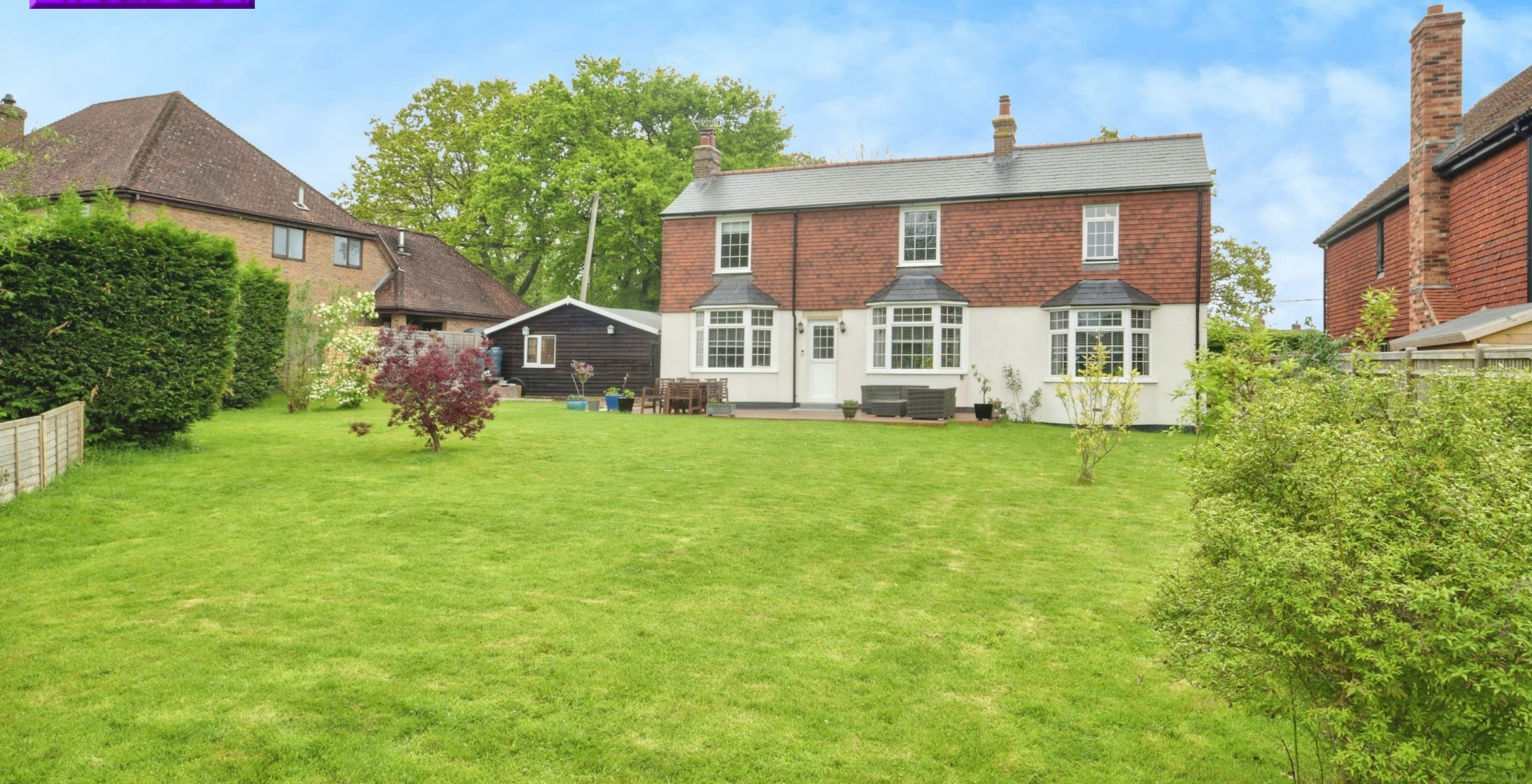
The Hunts, Coppards Lane, Northiam, East Sussex, TN31 6QN. £725,000 OIEO